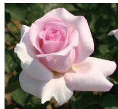
Fragrant hill, double winner of the Ministry of Land, Infrastructure, Transport and Tourism Award in the 1st International Fragrant Rose Trials

Through the process of hybridization the rose fragrance had started to disappear, so we began the International Fragrant Rose Trials in 2005 to encourage appreciation of the beauty of fragrant roses, and to further develop the fragrant rose garden at Echigo Hillside Park. Outstanding award-winning roses continue to be grown in the park. We predict that someday soon a world-famous fragrant rose will be discovered at Echigo Hillside Park.